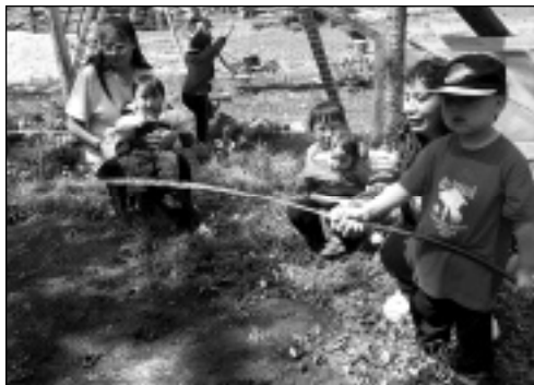
A Community Garden