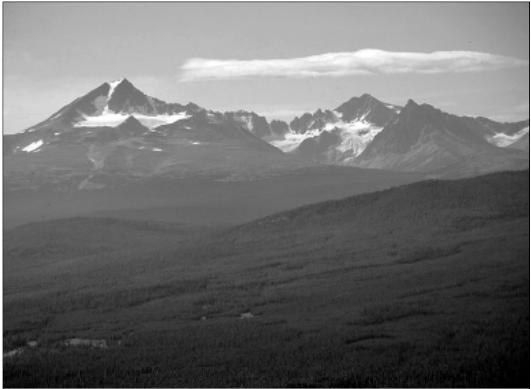
Nemiah Traditional Territory

Nemiah Aboriginal Wilderness Preserve, an area within which there was to be no logging, no mining and no commercial road building. The jewel in this preserve is the Brittany Triangle, bounded on the south by Nemiah valley, on the west by Chilko River and to the east by Taseko River. For three short years after the declaration, all seemed well, but in 1992 the BC Ministry of Forests gave Prince Rupert's Carrier Lumber a permit to log in the Brittany. The Xeni Gwet'in immediately erected barricades and the provincial government pulled the permit. On May 7, 1992, Carrier Lumber turned away.