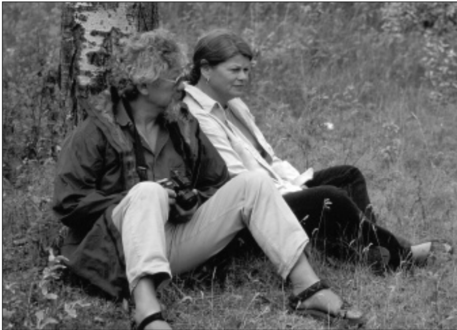
David Suzuki & Tara Cullis

economic and ecological ruin for future generations. If the local economy can be invigorated creatively, however, resource extraction will be only one element of the plan, and one that can be pursued at a sustainable pace. Looking at it this way, community development encompasses a social agenda as well as an environmental agenda, which is an ethos that has guided the Xeni Gwet'in for centuries: What is good for the land is good for the people; if you look after the people, they will look after the land.