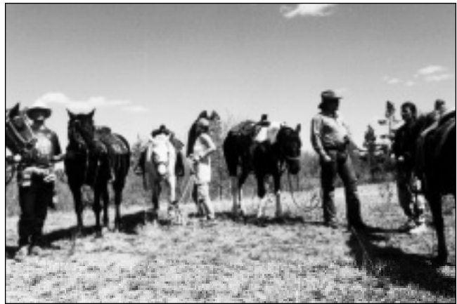
Trail Riding in Nemiah