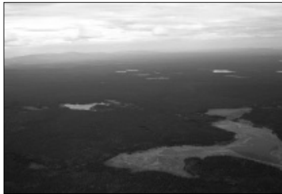
Smoking Fish (left), Ranching (top right), and Xeni Gwet'in Territory