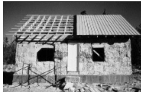
Straw-bale House Construction