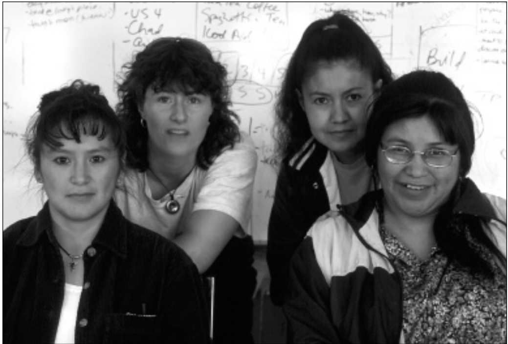
The ?Inteniluyni āam

Fear also exists that new economic development will bring activity that the community, or at least some members, may not want. The ?Inteniluyni team is acutely aware of this risk and is working hard to guard against it. On the plus side, the Xeni Gwet'in is one of few First Nations that doesn't have a contemporary-versus-traditional fracture. In part, this is because of the road or rather the lack of one for so many years. Nemiah's location helped its citizens stand up against industrial resource extraction even as their Tsilhqot'in neighbours were, in many cases, overwhelmed by pressure to log. As a result, the Xeni Gwet'in have no investment in